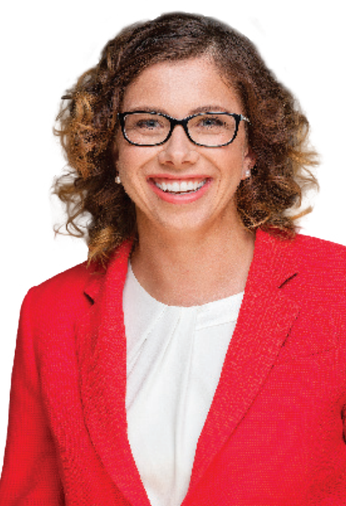
The Hon Amanda Rishworth MP Minister for Social Services