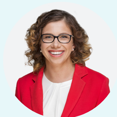
Amanda Rishworth Minister for Social Services