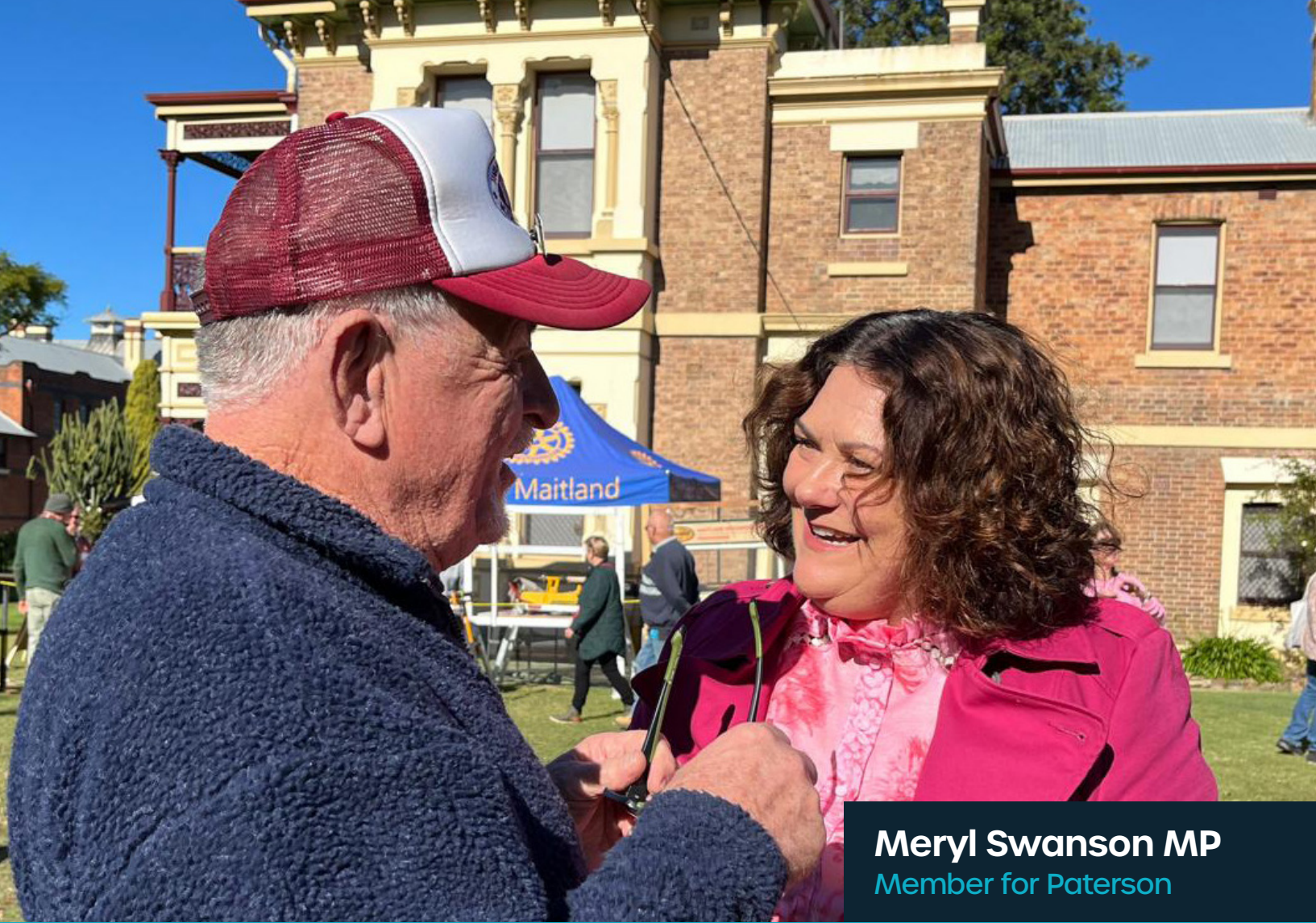
Meryl Swanson MP Member for Paterson